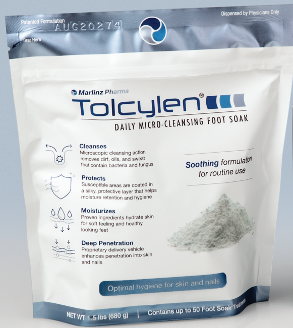
Daily Micro-Cleansing Foot Soak