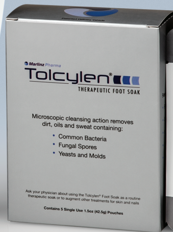
Therapeutic Foot Soak